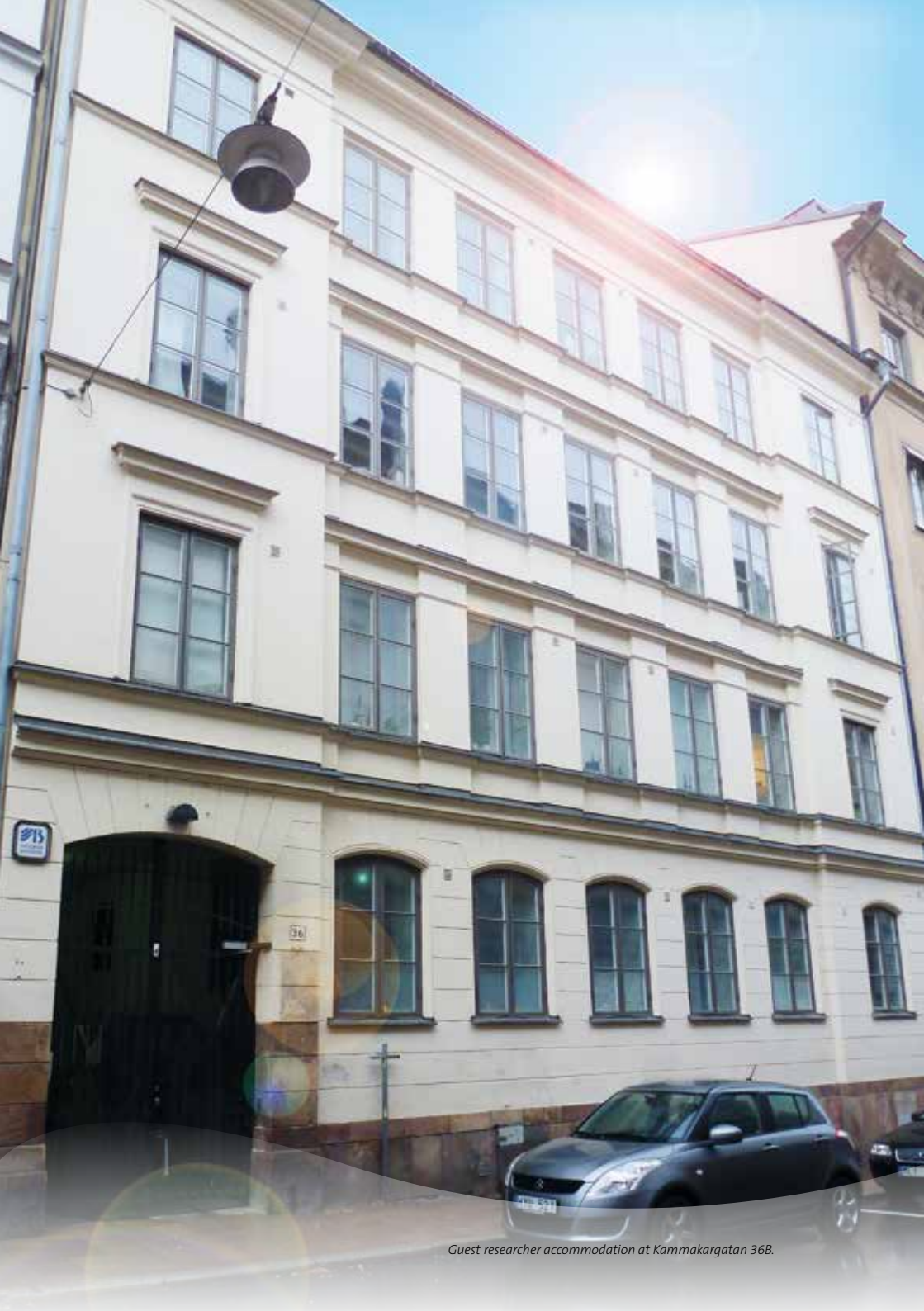
Guest researcher accommodation at Kammakargatan 36B.