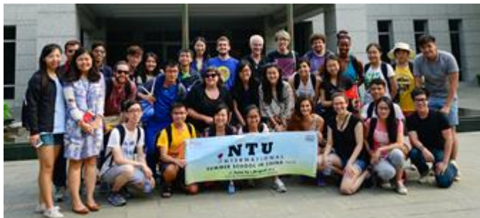
Top: Students enjoying their study tour to Tiananmen Square Middle: Students experiencing the rich culture in Shandong, the hometown of Confucius Bottom: Students visiting the Singapore Embassy in Beijing (July 2015)