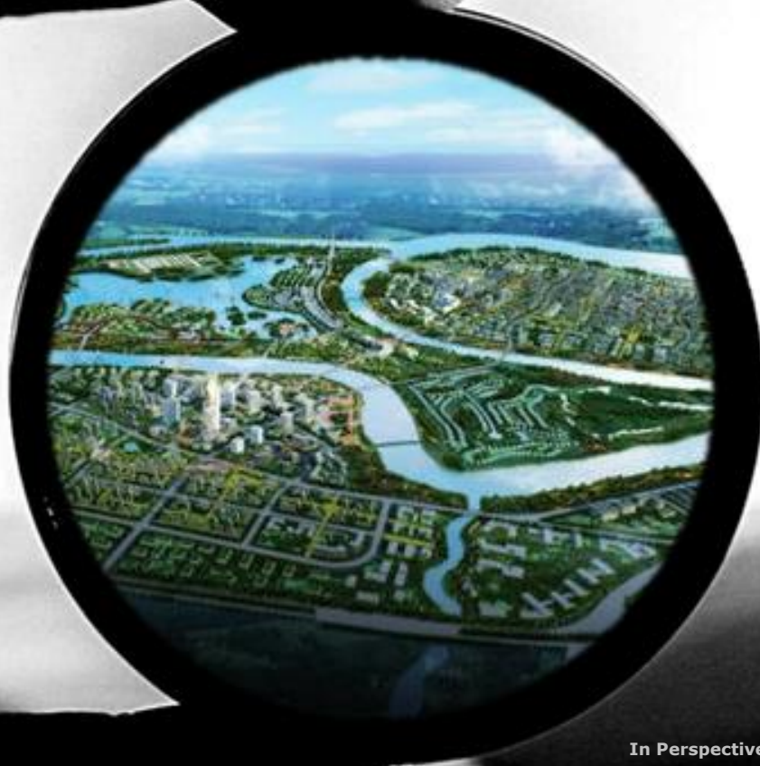
In Perspective: SINO-SINGAPORE TIANJIN ECO-CITY Tianjin, China