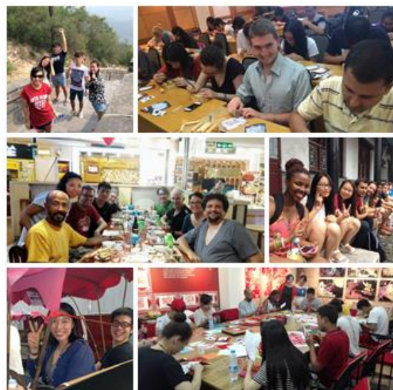
Snippets of life during Summer School 2015

All students must have travel and medical insurance for the duration of the programme.