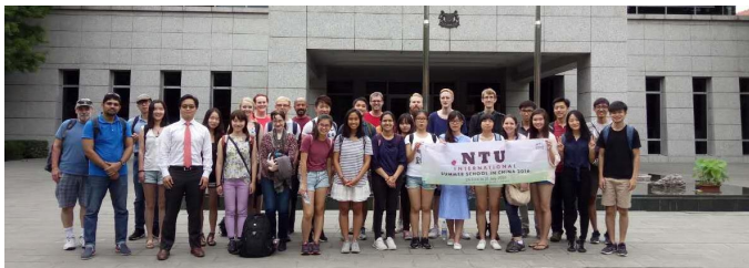
Top: Students enjoying their Chinese calligraphy classes Middle: Students basking in the rich Chinese culture outside the Porcelain House in Heping District of Tianjin City Bottom: Students visiting the Singapore Embassy in Beijing (July 2016)