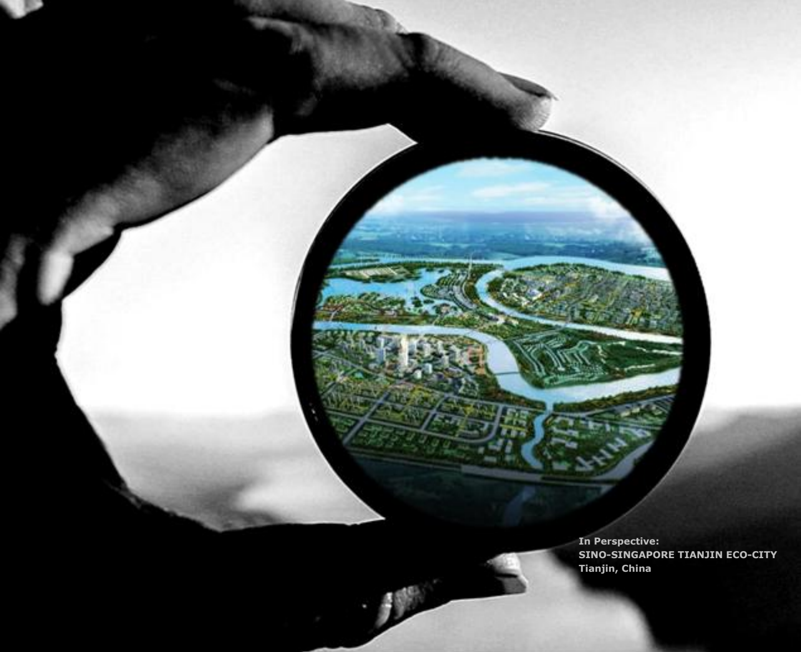
In Perspective: SINO-SINGAPORE TIANJIN ECO-CITY Tianjin, China